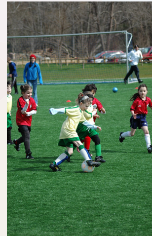
John B. Lewis Soccer Complex (2002, 2004, 2009)