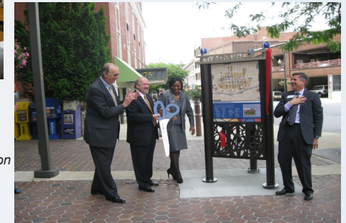
Asheville Area Wayfinding Program Ribbon Cutting (2010)