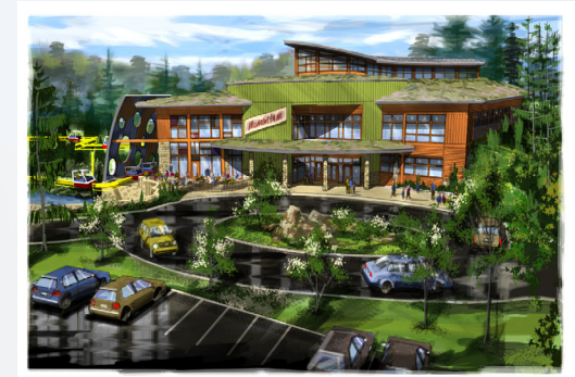
Momentum (2004, 2007, 2009)