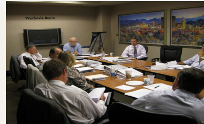
TPDF members reviewing applications (2010)